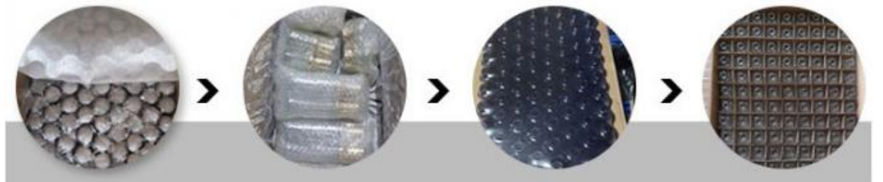
1. Bottle cap independent packaging

#Packaging ensures safety and worry free# strict delivery packaging to ensure safe delivery of products