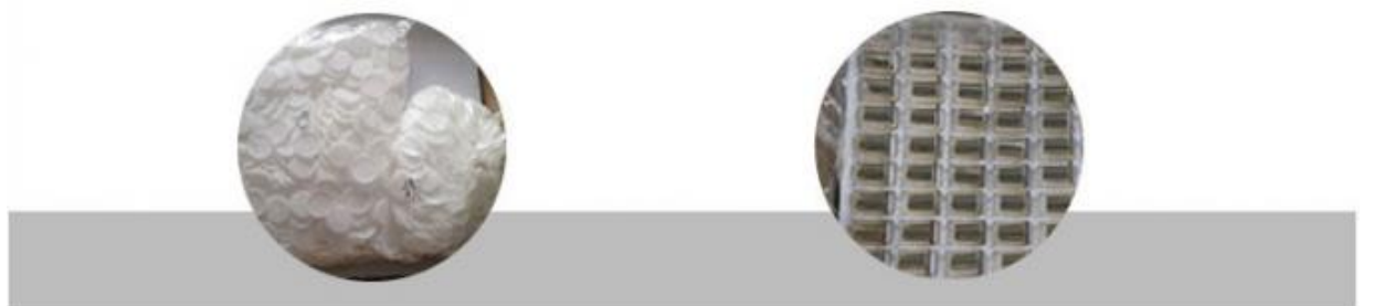
5. The hand mat is packed in waterproof dust plastic bag