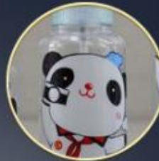
HEAT TRANSFER PRINTING