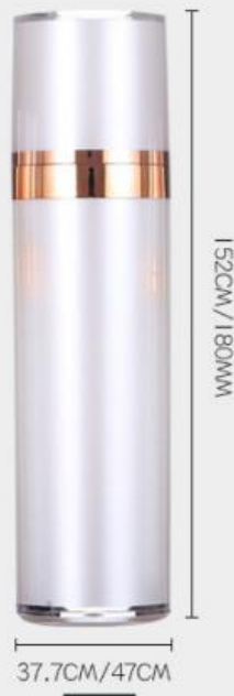
Straight round lotion bottle

50ML:wide37.7CM*high152MM 100ML:wide47CM*high180MM