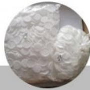
5. The hand mat is packed in waterproof dust plastic bag