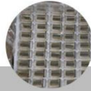
6. The bottle cap adopts independent partition and the outer layers wrapped with waterproof dustproof material bag