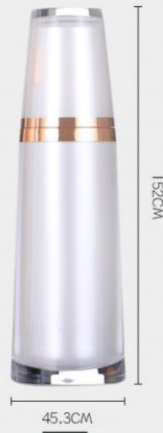
Inverted cone lotion bottle

30G:wide62.9CM*high44.5MM 50G:wide72.7CM*high47.9MM