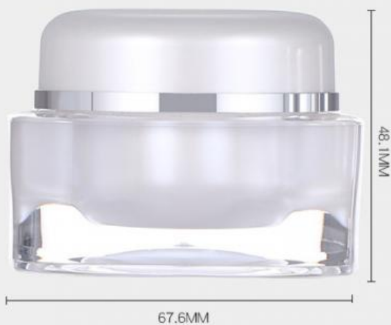
Old square bottle